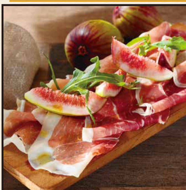
Prosciutto & seasonal fruits ¥880