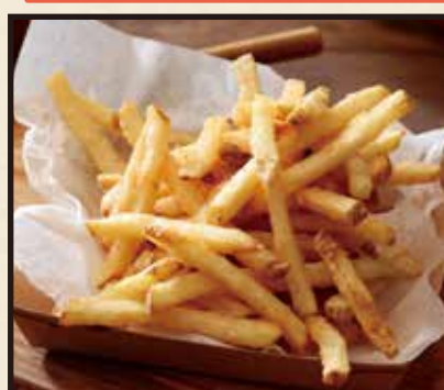
Truffle-flavored french fries