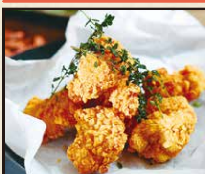
With the fragrant aroma of thyme The FARM TOKYO Fried Chicken