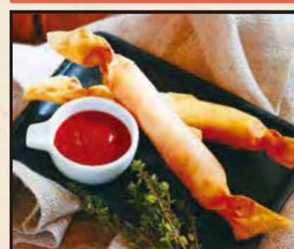
Bacon Wrap with Mozzarella Cheese 2 pieces