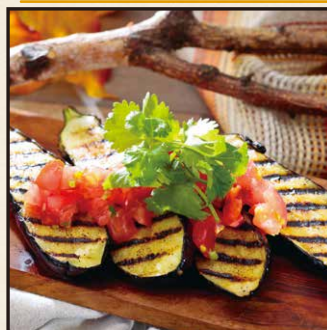
Charred eggplant with salsa tomato ¥500